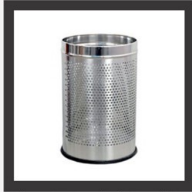
Airport/ Hospital Dustbin