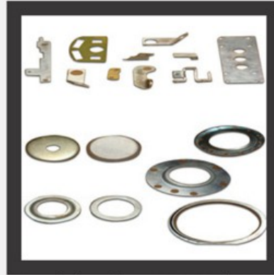
Precision Sheet Metal Component