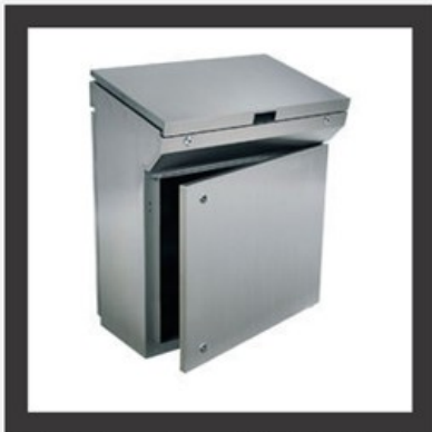
Stainless Steel Cabinets/ Enclosures