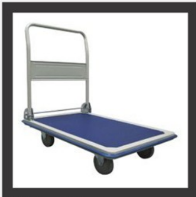
Platform Trolley 150kg/300kg