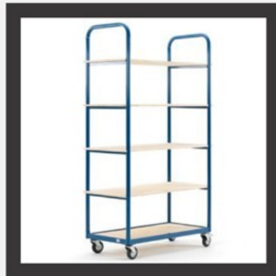
Platform Trolley With Shelf