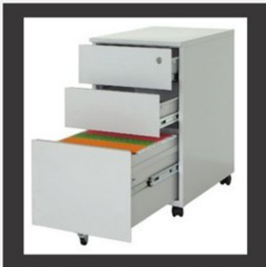
Office Filing Cabinets