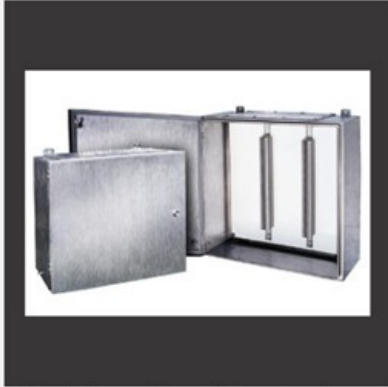
Stainless Steel Control Panel