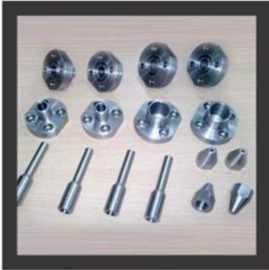
Precision Turned Component