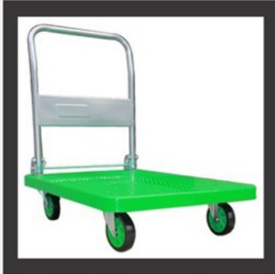
Hand Platform Trolley