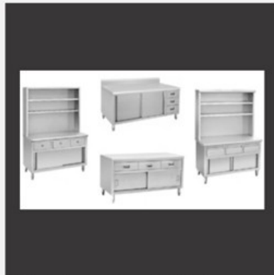
Stainless Steel Kitchen Equipments fabrication