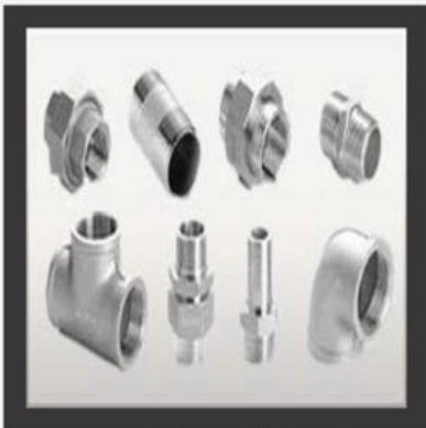
Stainless Steel Fittings