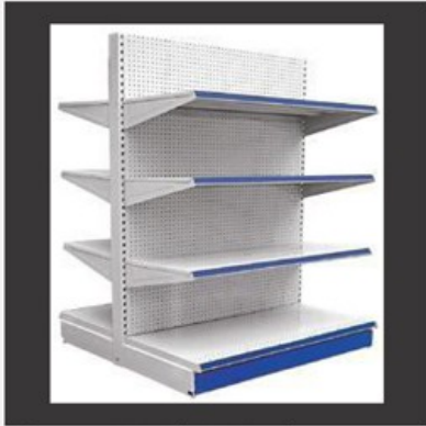
Super Market Racks