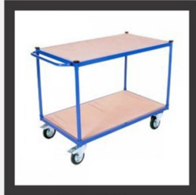
Heavy Duty Table Platform Trolley